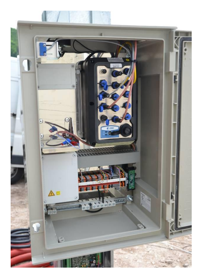
Figure 5: RWIS data management unit.