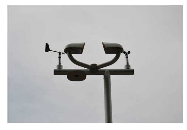
Figure 3: Anemometer, wind vane and precipitation detector.