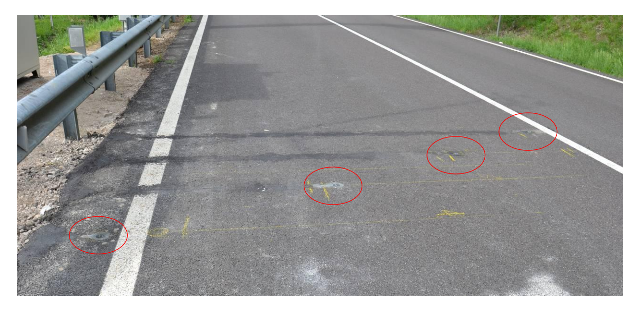
Figure 4: Sensors installed on the road surface

On the road, four equidistant invasive road surface conditions sensors measuring (i) the temperature of the first centimetres of the superficial layer and (ii) the saturation level of the liquid film on the surface are installed.