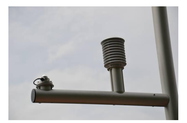
Figure 2: Pyranometer, thermometer and RH detector.

On the road, four equidistant invasive road surface conditions sensors measuring (i) the temperature of the first centimetres of the superficial layer and (ii) the saturation level of the liquid film on the surface are installed.