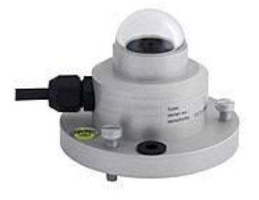
Figure 10: Solar radiation sensor,