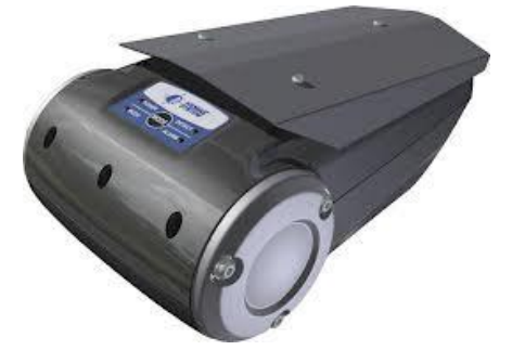
Figure 13: Non-invasive traffic sensor.

This sensor has been designed to monitor the road surface conditions; it can detect the underground (4 cm depth) and surface temperature and also the saturation level of the liquid film on the road. This technology represent an important instrument for planning the winter road clearance with the possibility to set alarms in case of dangerous conditions [8].