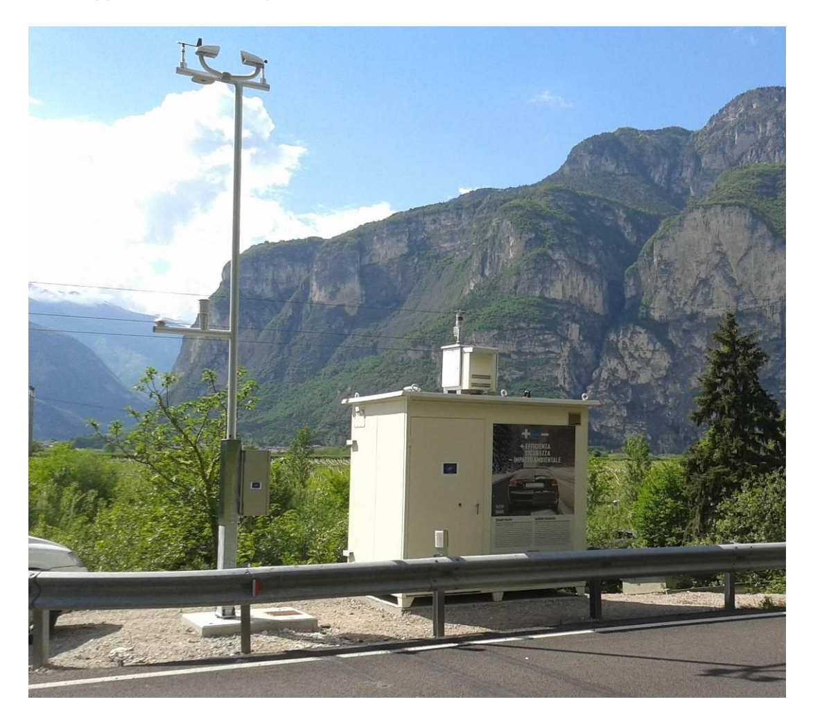
Figure 1: Typical configuration of RWIS station.

Figure 1 shows the typical configuration of a RWIS station; the pole on the left is the standard support for the atmospheric sensors.