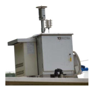
Figure 15: Air quality monitoring station.

This method consists on a gravimetric sampling technique based on a quantitative determination of particulate of a certain diameter based on its mass. In the PM10 sampler, a separating cyclone is able to select the particulate of a size smaller than 10 \mu m, that is hold on a filter. Therefore the filter is weighed in a laboratory using suitable and standardized weighing equipment.