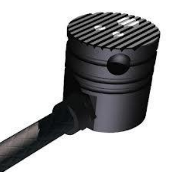
Figure 14: Road surface conditions sensor.